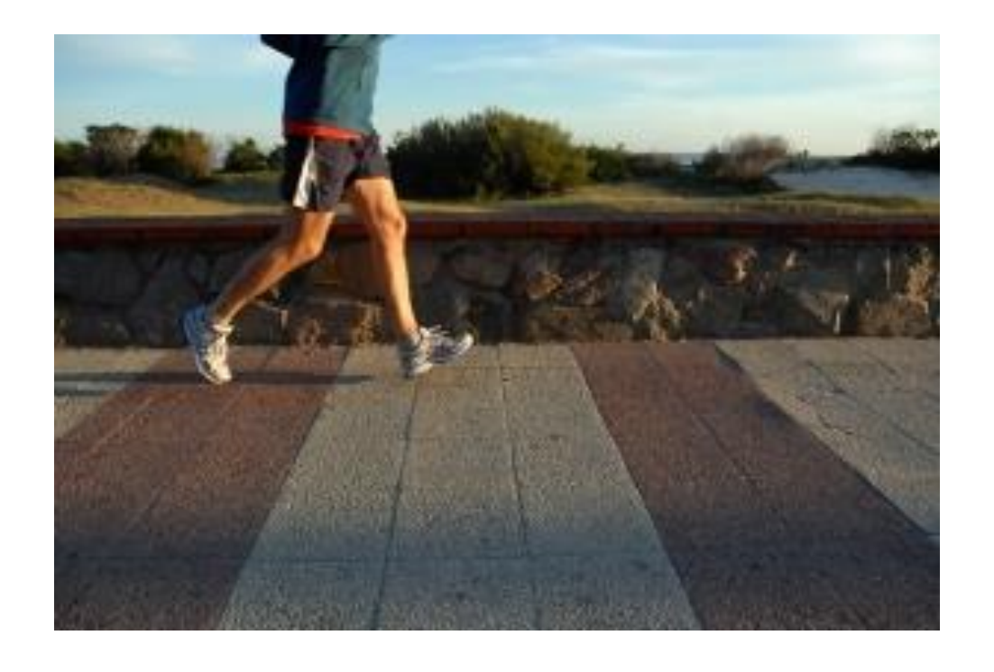
Push Your Limits Unleash your body power & increase your body endurance

Not everyone can just be physically fit without some level of conscious effort, and to be able to claim physical fitness, the individual needs to have a proper plan in place to work with. Get all the info you need here.